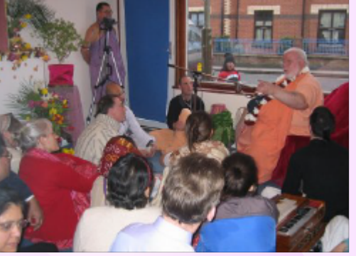
Puri Maharaja speaks about the most merciful Lord Gauranga

deities. The final count revealed that there were at least 150 different bhoga preparations. In fact much of the temple room floor was covered by these offerings of love, made by devotees from Leicester and other parts of the country.