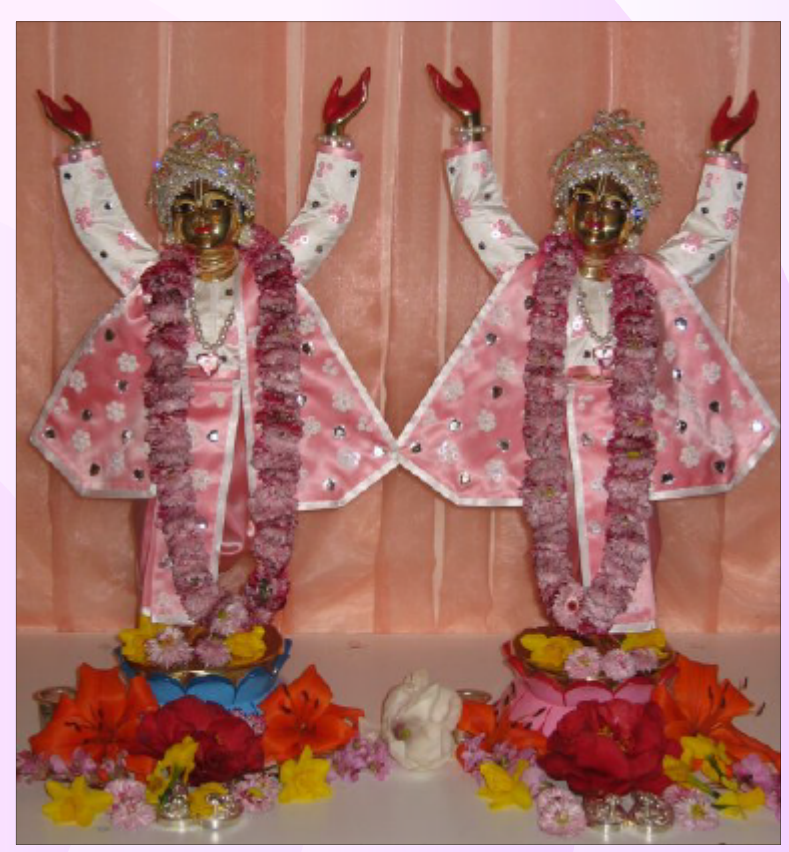
Sri Sri Nitai Saci-Sundar, the most beautiful Lords at the Hare Krishna Centre in Leicester

Devotees from throughout the UK came to celebrate the installation of the deities and the opening of the Centre.